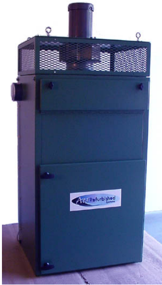
Custom FPW-30-02 unit with 1 HP motor for major OEM (inlet plenum and floor stand not shown).