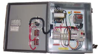
Custom built Starter shown above