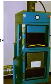
Custom MVDCI-10-20XP Unit with dry filters, carbon module and explosion proof motor.

Designed specifically for wet applications, the MV Series line of Media Filter collectors provide cost effective and efficient control of mist, dust, fume, smoke and gas/vapor contaminants as individual or as more complex combined forms. A number of design specific features are incorporated in these systems to improve cabinet sealing and enhance system performance with reduced unit maintenance on wet applications.