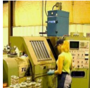
MC-500 unit machine mounted installation on Mori Seiki TL-1 CNC machine

Designed primarily for machine mounted or ceiling hung wet applications, the MC Series line of Media Filter, Compact collectors provide cost effective and efficient control of mist and wet dust/swarf contaminants in a compact, economical, easy to install system. Additional features and options were incorporated into the 1200 series units that allow them to handle mist, dust, fume and smoke contaminants as individual or as more complex combined forms and also feature a floor mounting option. The MC series units feature the same industrial grade filters, blowers and motors used in our other systems but housed in a smaller, Compact, economical unit.